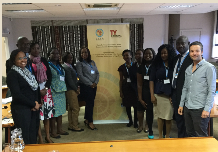
Participants at the capacity building workshop