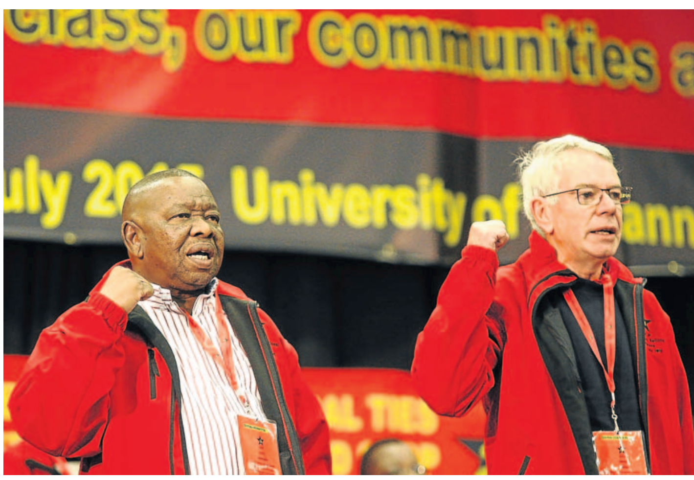
STATUS QUO: Blade Nzimande and his deputy Jeremy Cronin at the SACP special congress in Soweto

Nzimande, who is higher education minister, led the counteroffensive against those pushing for the SACP to go it alone. "We must be careful that we don't take decisions on a serious