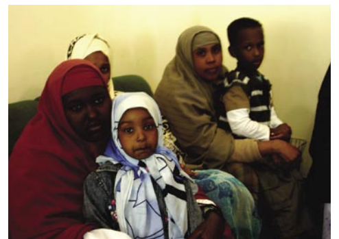
These Somali women and their children are just some of the 3 682 new clients seen by the UCT Refugee Law Clinic in 2006. The three professional staff who work in this area really do a stirring job.