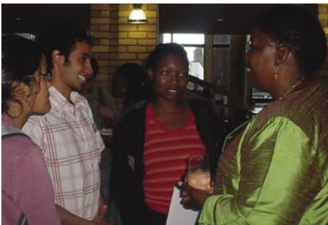
Deputy Minister of Health, Nozizwe Madlala-Routledge, chats to students.