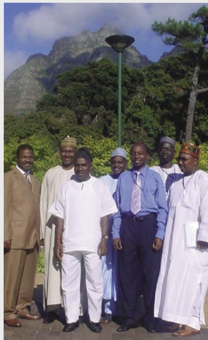
Staff of the National Assembly of Nigeria attended a workshop at the UCT Law Faculty entitled 'Comparing experiences across Africa'.