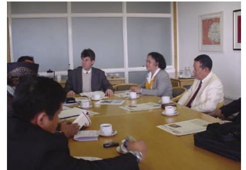
The Dean speaks to a delegation of the Indonesian parliament.