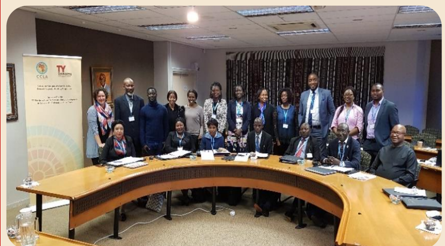
Group photo of some of the attendees