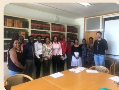
Group photo of seminar attendees